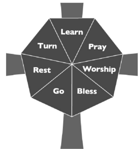
THE WAY OF LOVE Practices for Jesus-Centered Life